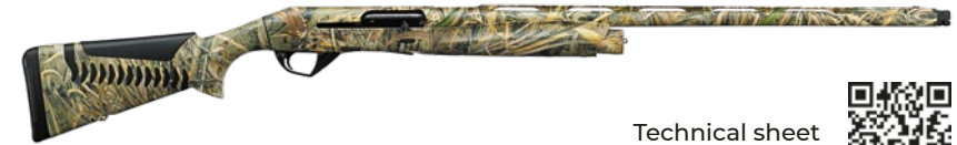
SUPER BLACK EAGLE 3 CAMO MAX 5